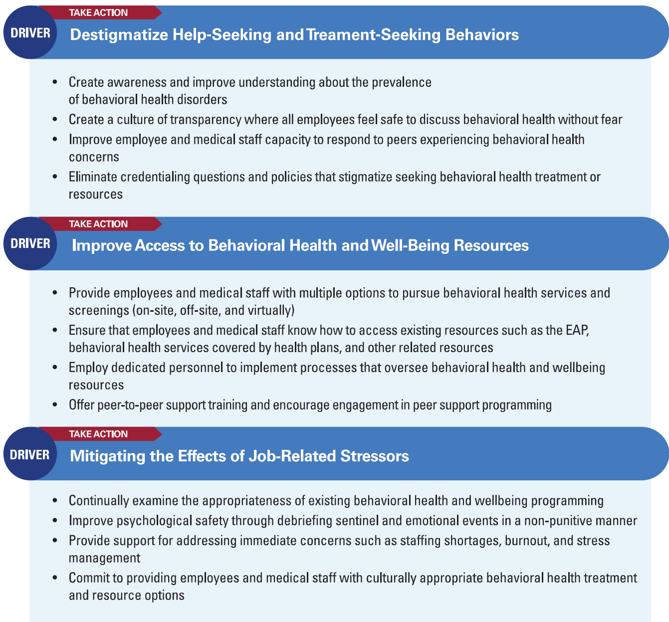
Figure 2. Addressing the Drivers of Suicide in the Health Care Workforce

While the literature review did not reveal any one specific intervention with strong evidence of preventing suicide among health care professionals, several interventions identified in the literature, survey data, and interview and focus group data demonstrated some indication of effectiveness and a broad uptake among hospitals and health care systems. As the research community devotes more attention to this issue, hospitals and health care systems can introduce resources and support as a foundation for building evidence-based approaches and ensure that adequate, high-quality behavioral health and well-being and suicide prevention resources are offered.