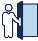
Increasing Access to Services

A robust suicide prevention program should incorporate interventions that address all three drivers. The interventions are categorized into four types, according to their area of focus: