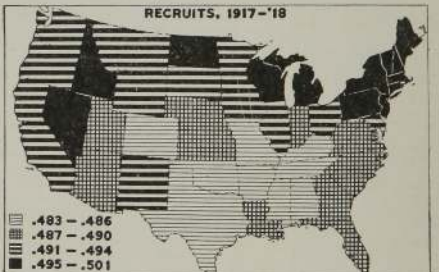
6 MEAN CH. (EXP.) ÷ MEAN HT. = IN.