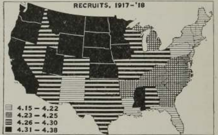
4 MEAN WT. ÷ MEAN CH. (EXP.) = LBS.