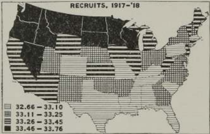
5 MEAN CHEST (EXP.)