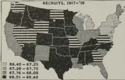
1 MEAN HEIGHT