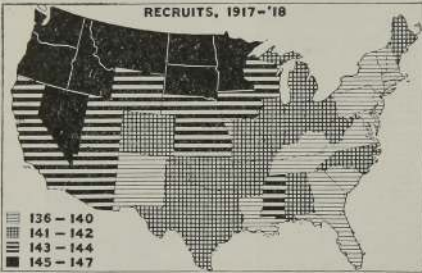
3 MEAN WEIGHT