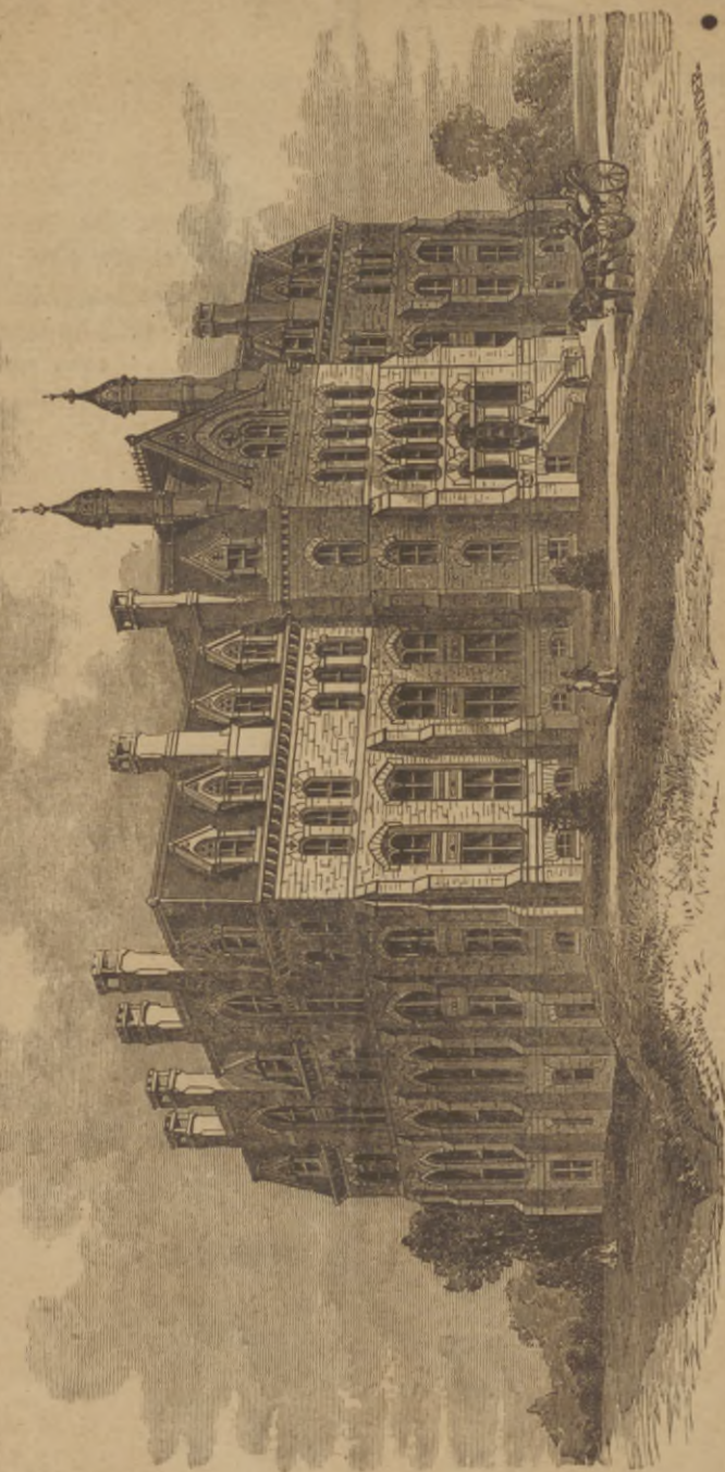
UNIVERSITY OF PENNSYLVANIA, MEDICAL DEPARTMENT.