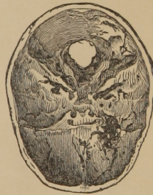
View of the base of the skull from within; the orifice caused by the passage of the iron having been partially closed by the deposit of new bone.