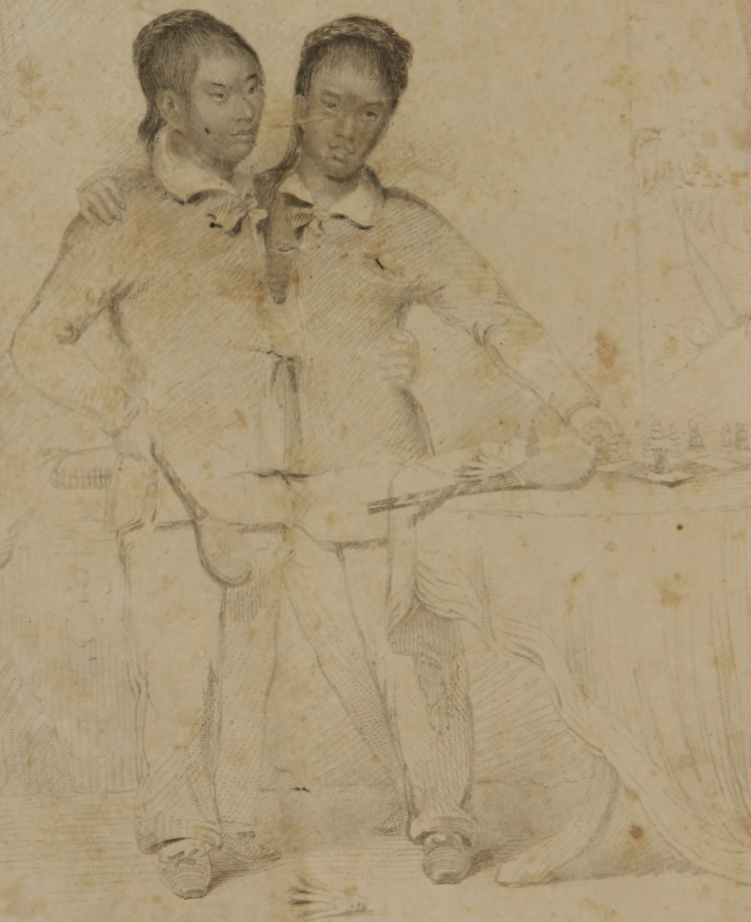
ENG and CHANG, THE CELEBRATED SIAMESE YOUTHS.

Published as the Act directs. Jan: 28. 1830.