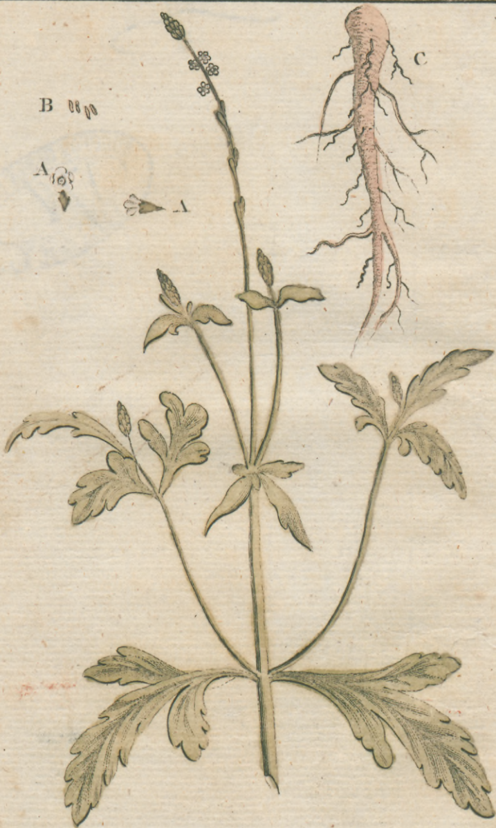
The Common Purple Vervain. { Flower.....A { Seed.....B { Root.....C