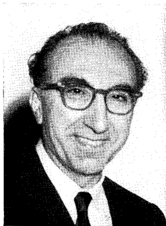
MICHAEL E. DeBAKEY , professor of surgery at Baylor University College of Medicine and member of MWN's Editorial Advisory Board, was chairman of the board of regents of the National Library of Medicine in Bethesda.

▶ Mounting of an assistance program to augment the