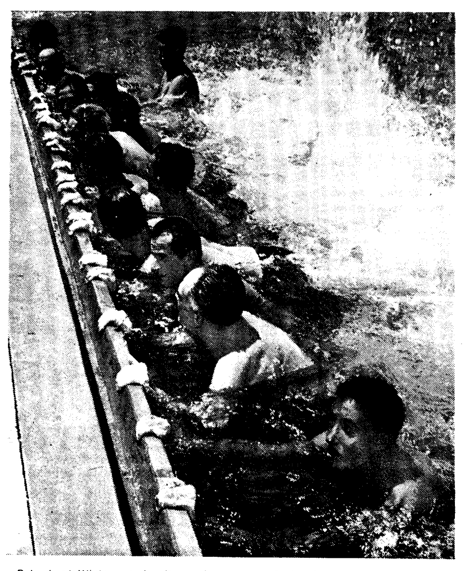
Patients at Winter enjoying the outdoor pool on the hospital grounds, patients who need an outlet for their bottled-up personalities benefit g an hour a day of threshing about in the pool enefit greatly from

TS enormously expanded teaching program is, in reality, the hope of both American and world psychiatry. Every hospital, clinic, or service organization caring for the mentally ill is severely handicapped by the dire shortage of personnel in the psychia-