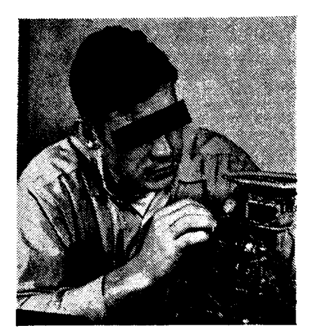
A veteran at Winter hospital works in the radio repair shop

Suggested assignments for the selfcentered type of patient include painting, drawing, pottery, music, party