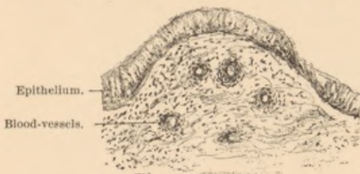
Seropurulent maxillary sinusitis in chronic lead-poisoning.

entered the cavity through the hard palate under cocaine anæsthesia with the aid of a spearhead drill—this method, which is quick and painless, I employ frequently—and by injecting sterilized warm water a slight seropurulent discharge was observed coming from the right nostril. Shortly after the patient was somewhat relieved, and I decided to open the antrum through the canine fossa. This was accomplished under chloroform with a large trephine drill. The antrum showed in the lower and side walls a peculiar bluish-gray hypertrophy of the mucous membrane. Probing did not reveal any caries of bone, but touching certain places produced severe pain. Microscopical examination of the hypertrophy, made by