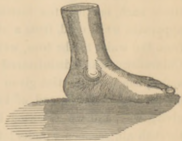
Copies of casts taken after treatment.

The left foot was cured, or nearly in the condition you now see it, in about six weeks. (See Figures 3 and 4.) In the right, how-