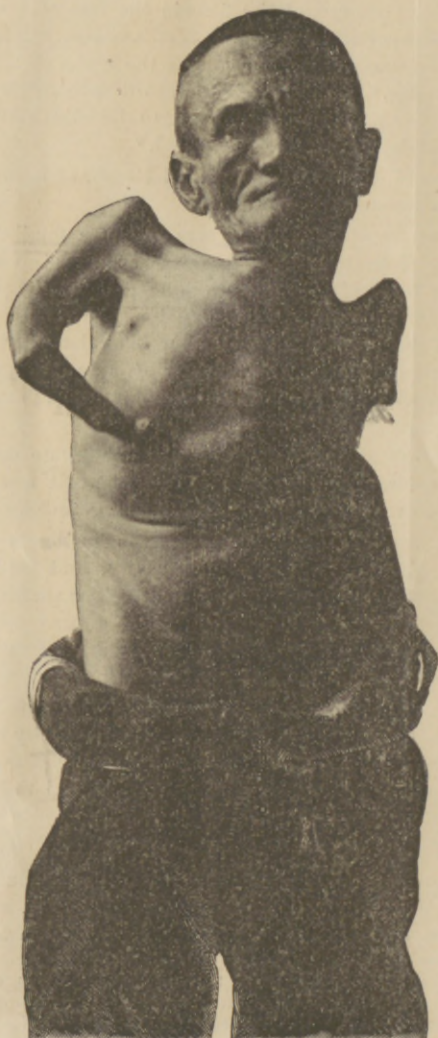
FIG. 1—Front view of a case of Perobrachia, showing the rudiment of the left upper extremity, and the undigitable right upper extremity.