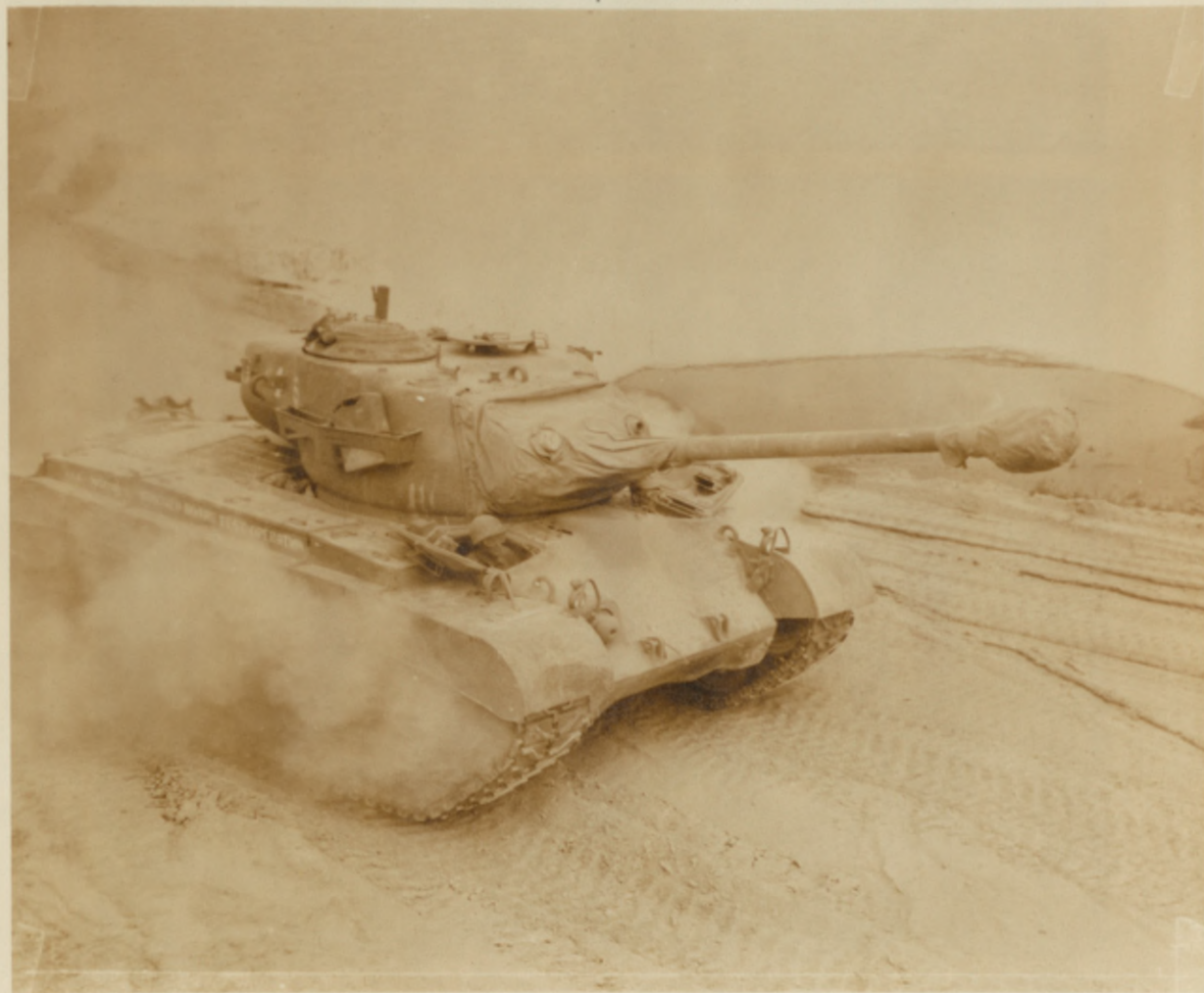
Dust Pattern for Heavy Tank, M26 with Fenders and Sand Shields ARMORED MEDICAL RESEARCH LABORATORY FORT KNOX, KY. July, 1945