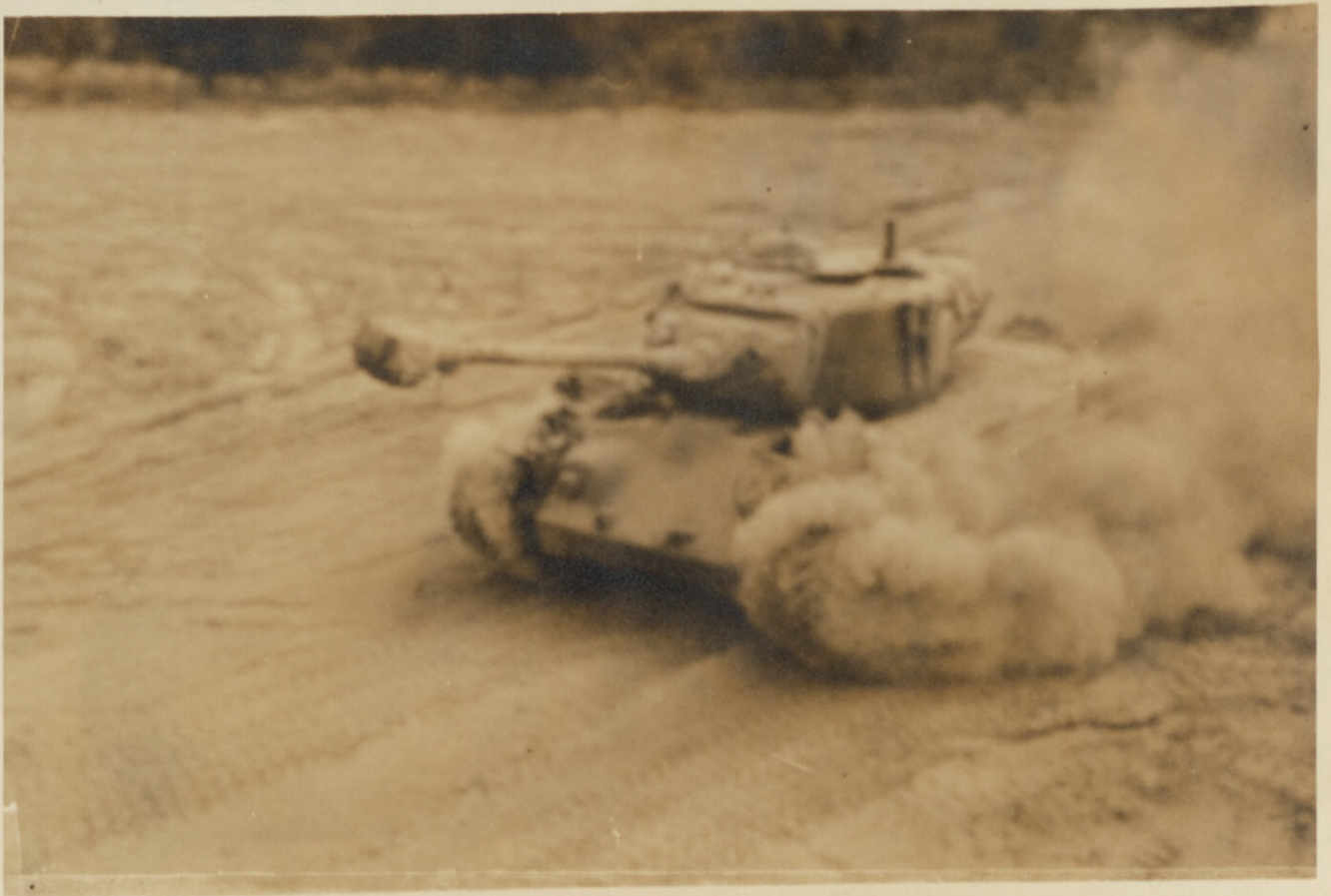
Dust Pattern for Heavy Tank, M26 without Front Fenders and Sand Shields ARMORED MEDICAL RESEARCH LABORATORY FORT KNOX, KY. July, 1945 Figure 3, Project No. 45