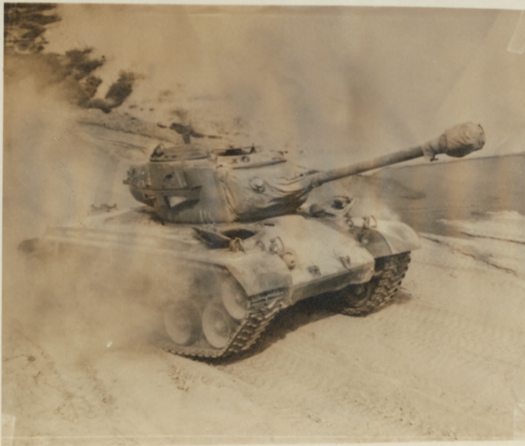
Dust Pattern for Heavy Tank, M26 with Fenders without Sand Shields ARMORED MEDICAL RESEARCH LABORATORY FORT KNOX, KY. July, 1945 Figure 2, Project No. 45