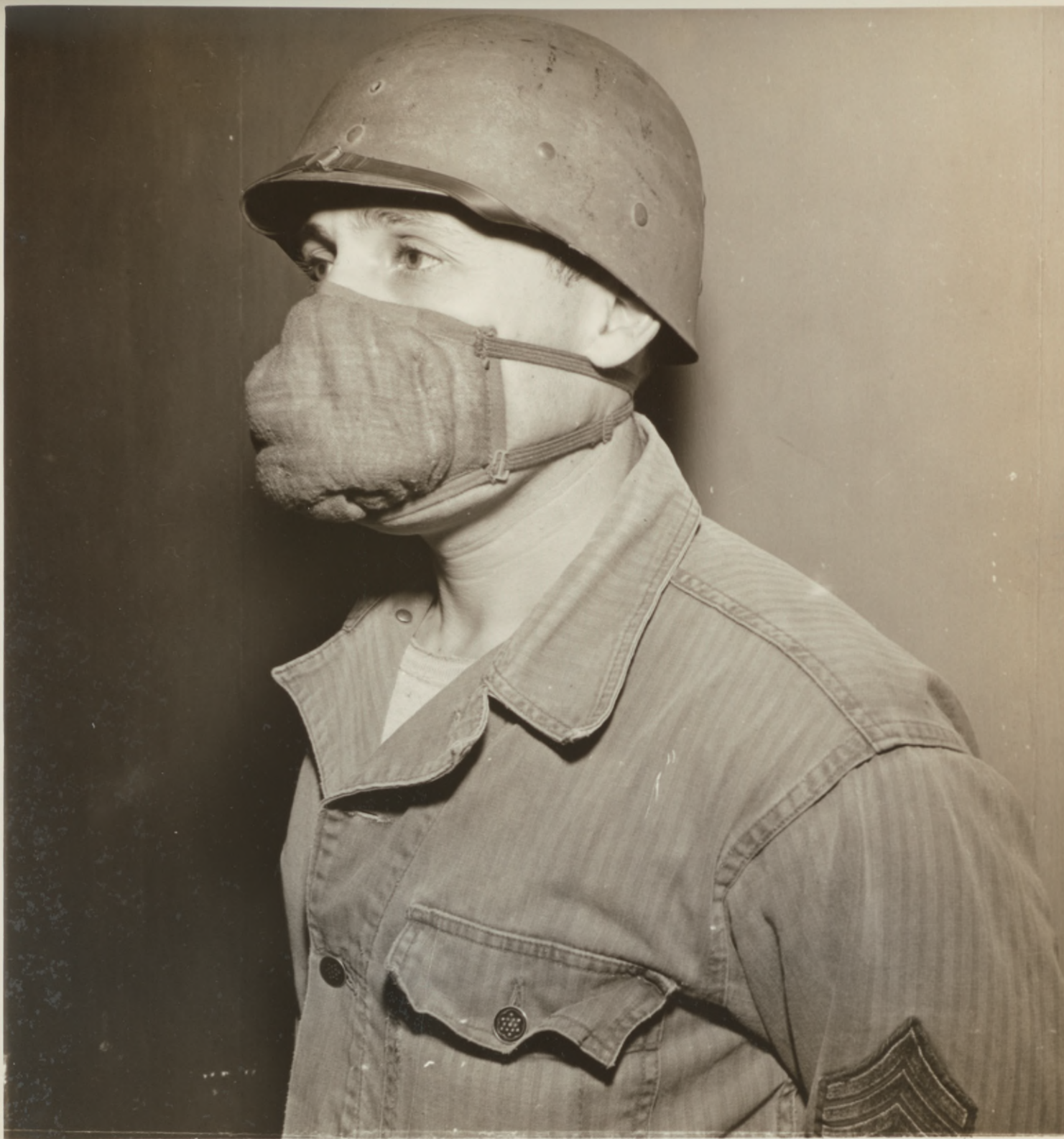
Fig. 1 Expendable Dust Respirator, E5 ARMORED MEDICAL RESEARCH LABORATORY FORT KNOX, KY.