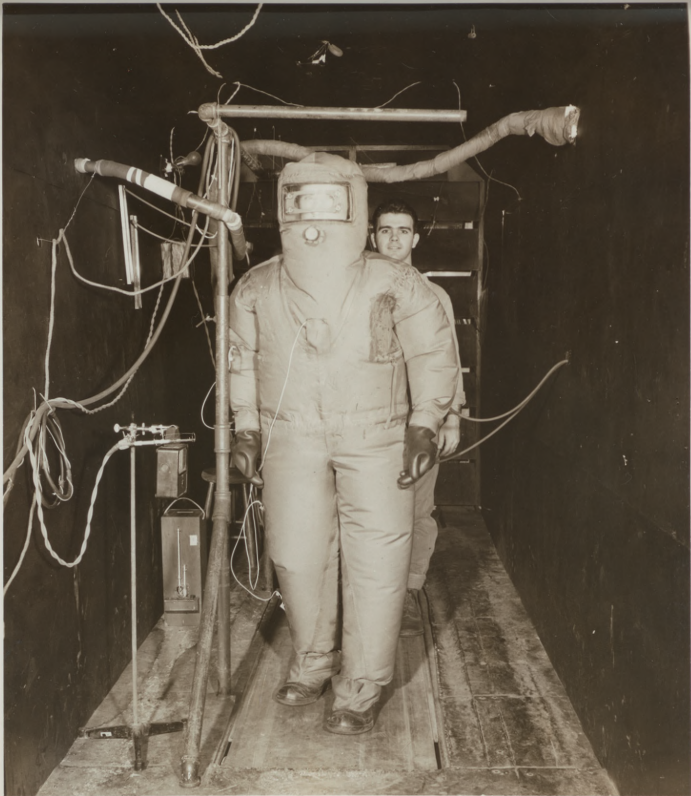
View of men on treadmill showing some of test apparatus. ARMORED MEDICAL RESEARCH LABORATORY FORT KNOX, KY.