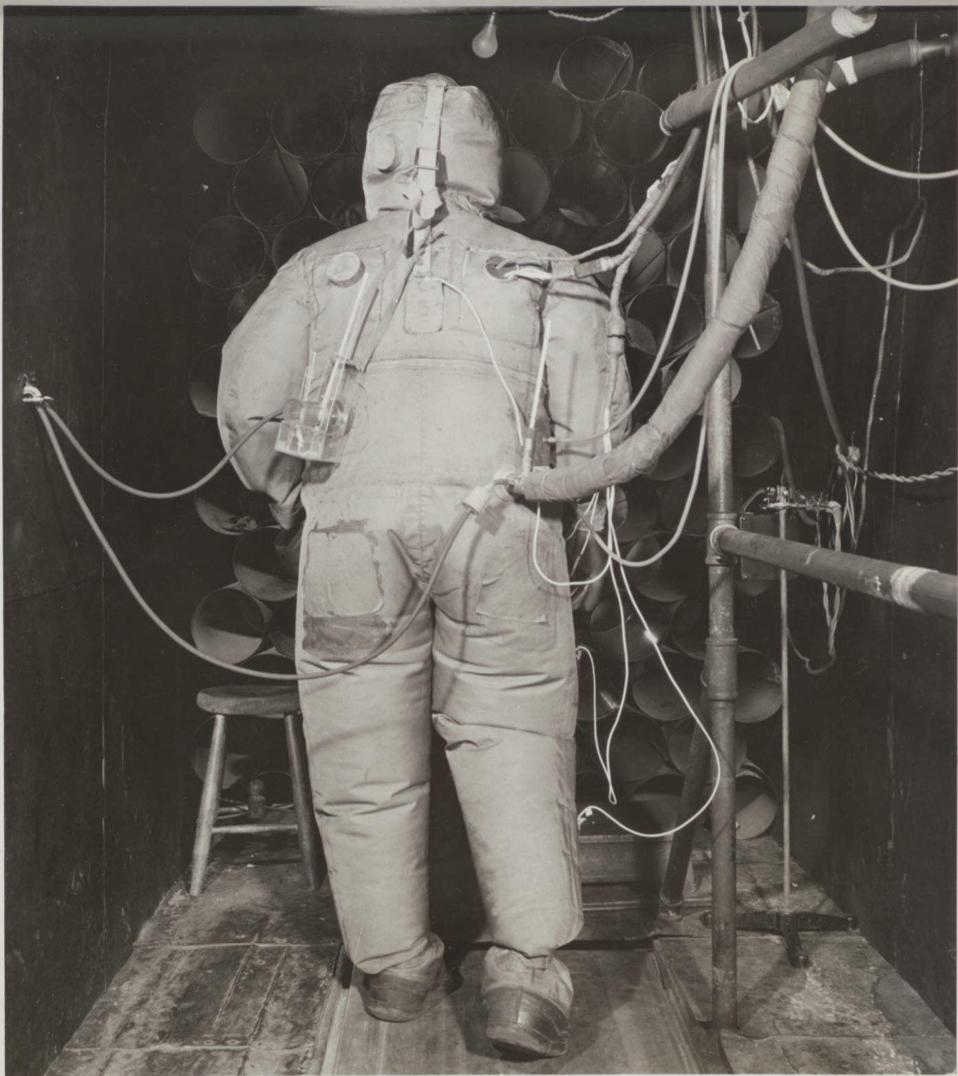
Back View of Ventilated Suit showing apparatus used in the test runs ARMORED MEDICAL RESEARCH LABORATORY FORT KNOX, KY.