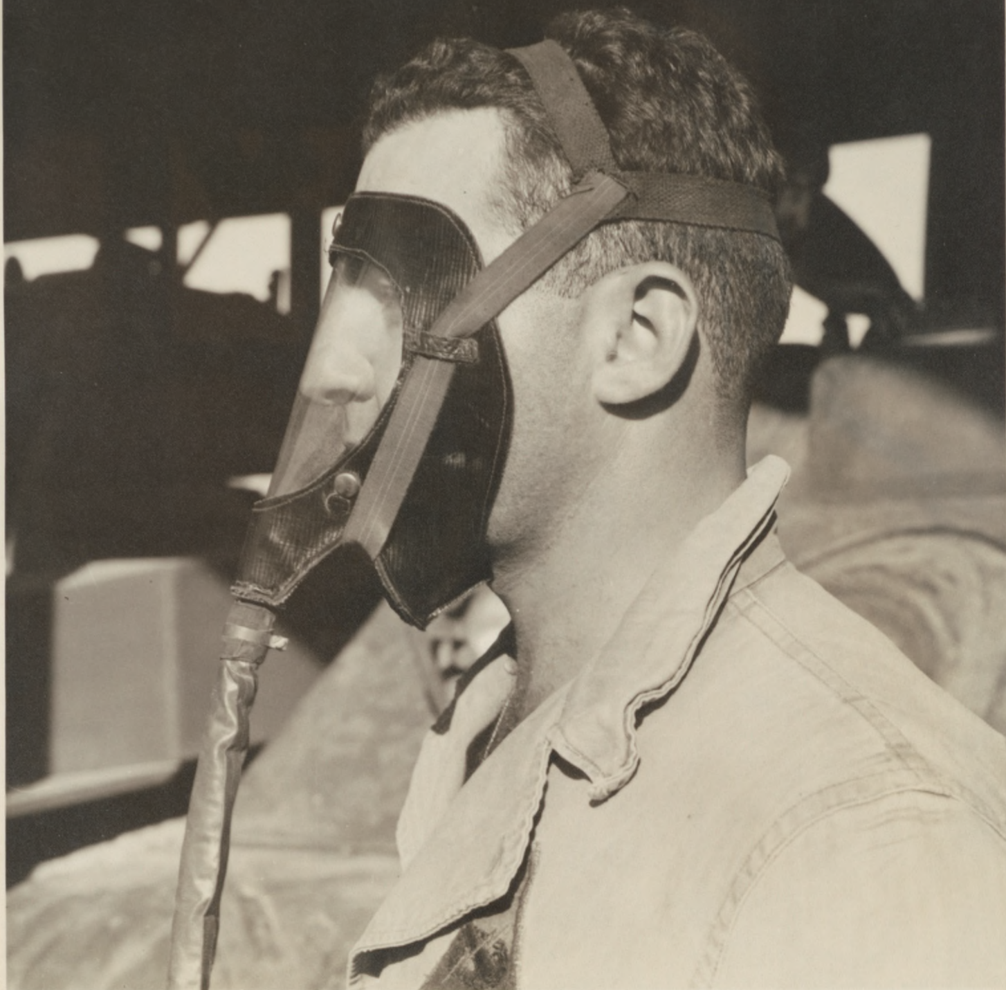
FIG. 2 FACEPIECE, SIDE VIEW

A.G.F. MEDICAL RESEARCH LABORATORY FORT KNOX, KY.