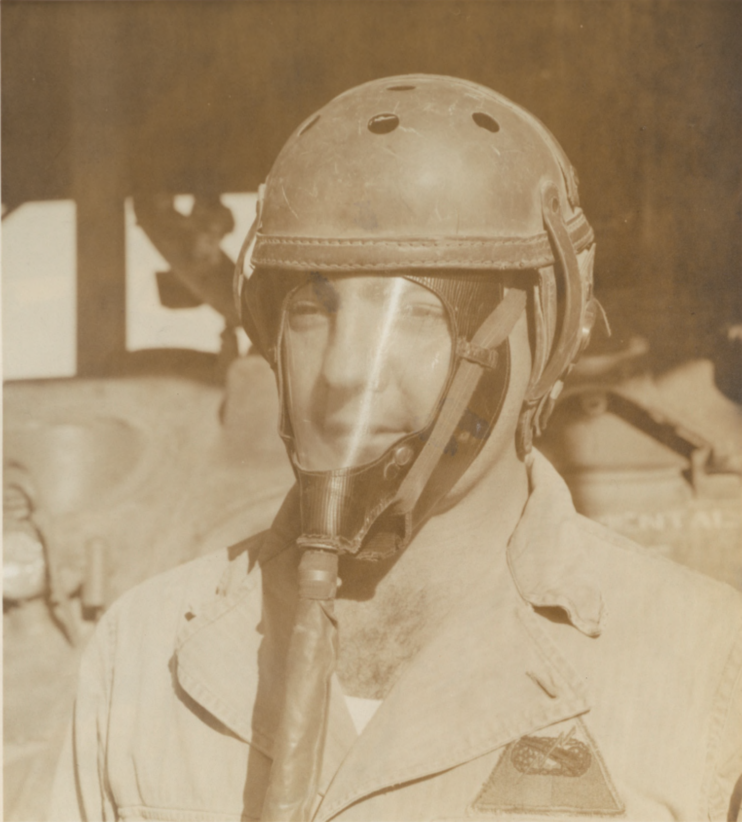
FIG. 1 FACEPIECE, FRONT VIEW, WITH TANK CRASH HELMET A.G.F. MEDICAL RESEARCH LABORATORY FORT KNOX, KY.