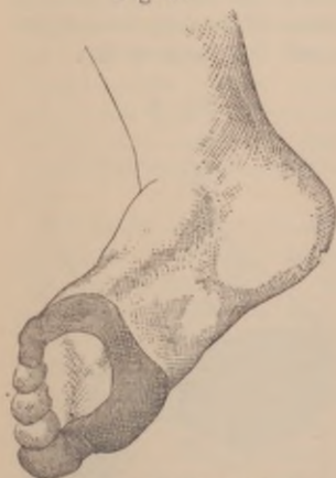
Area of pain in left foot, Oct. 1877.

I saw this patient about two weeks later, and found him in bed, with the bed-clothes lifted off his feet by the aid of a cage of half hoops. The congested look of the pain areas in the sole was remarkable. They looked like severe frost-bites. The sudden increase of pain and filling of the vessels on his assuming the erect posture were as notable as ever, and the rapid whitening, when the legs were lifted, seemed to me no less interesting. Pressure on the right sciatic nerve suddenly increases the sense of burning. As he was notably thin and pale, it was agreed that he should continue to take dialyzed iron and cod oil, and that massage should be used daily, as before, on the feet and legs. He was also dry-cupped over the spine.