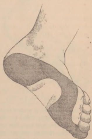
Area of pain in right foot, June to December, 1877.