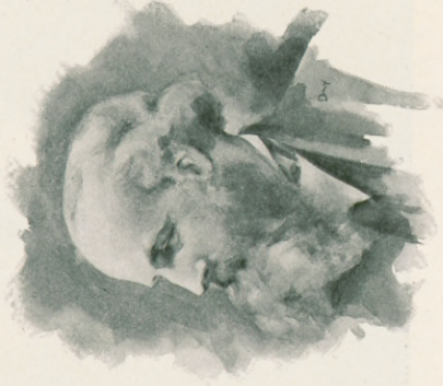
JAMES CLERK MAXWELL.