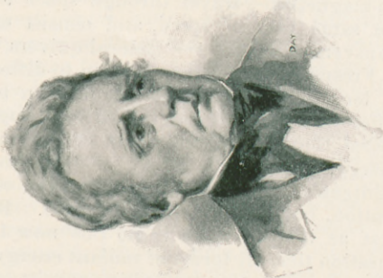
HANS CHRISTIAN OERSTED.