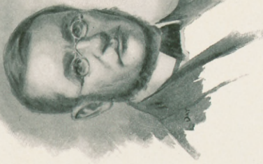
JULIUS ROBERT MAYER.