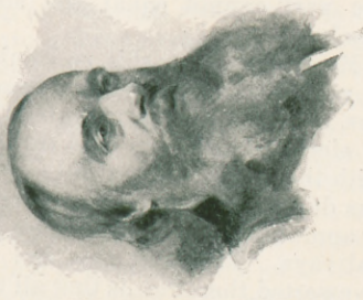
JAMES PRESCOTT JOULE.