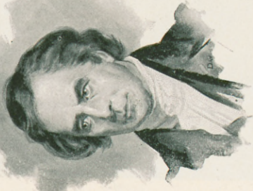
DOMINIQUE FRANÇOIS ARAGO.