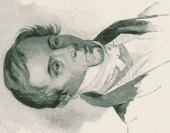
AUGUSTIN JEAN FRESNEL.