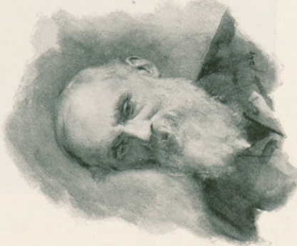
WILLIAM THOMSON (LORD KELVIN).