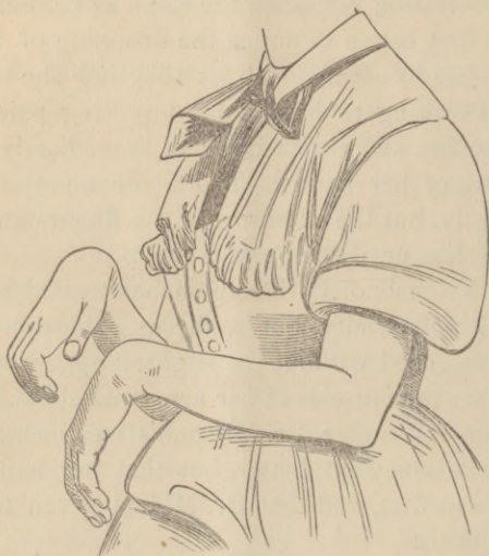
Lead palsy from use of "Laird's Bloom of Youth," from a photograph.