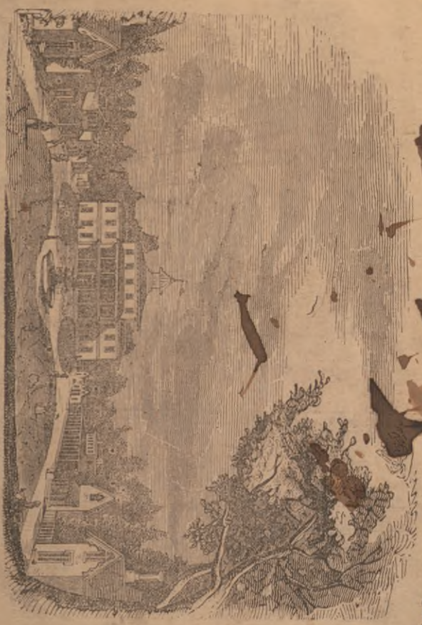
TAWAWA HOUSE, XENIA SPRINGS.

ARMY MEDICAL LIBRARY WASHINGTON, D. C. U. S. A.