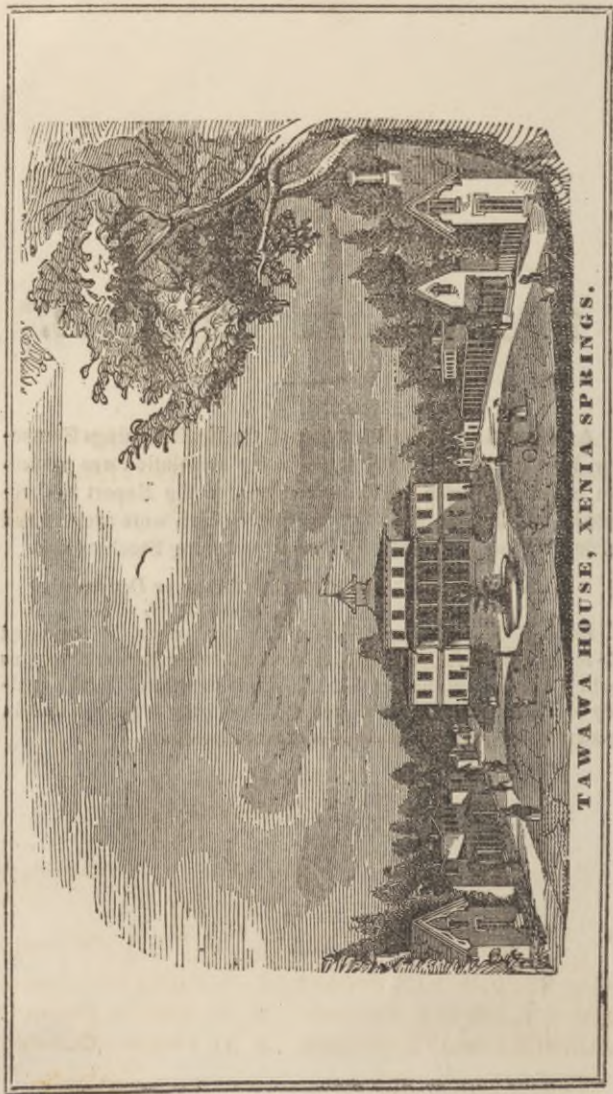
TAWAWA HOUSE, XENIA SPRINGS.