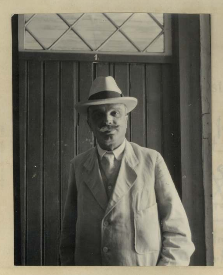
The Italian Doctor.