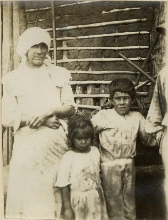
Mother 32 8 yrs 16 yrs