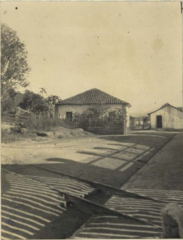
In Campo de Tenente

With the very best of remembrances and I think from all I know now of Brazilian postoffices, the very best of Christmases