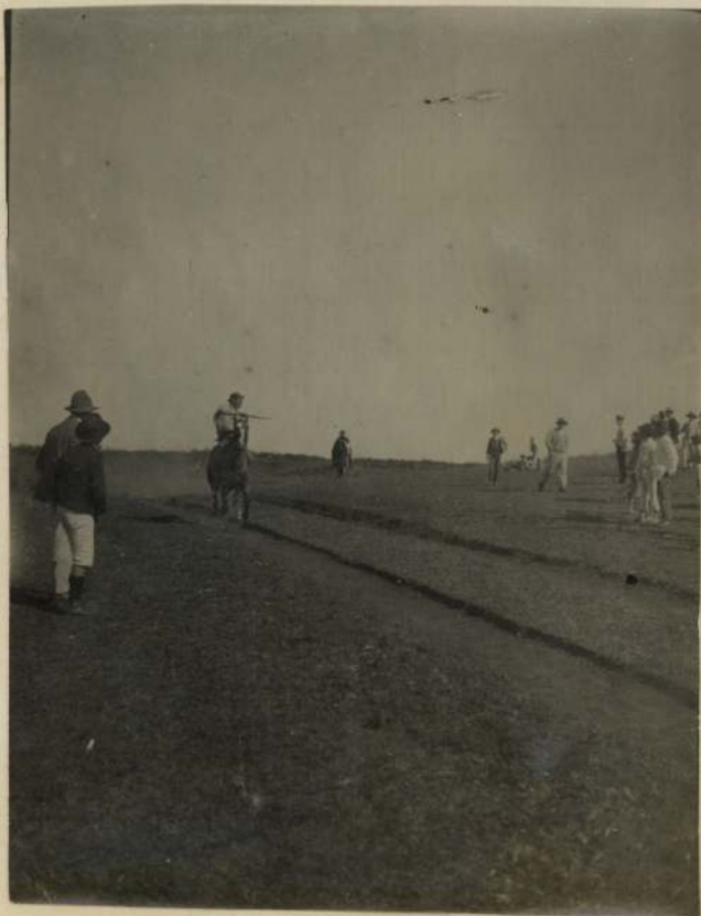
Horse race Lapa