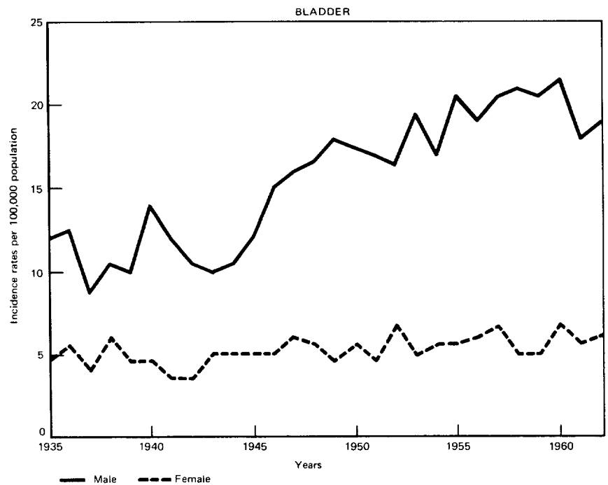
FIGURE 5—Age-adjusted rates of the incidence of cancer of the bladder, for males and females: Connecticut, 1935-1962.