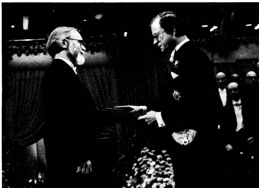
King Carl Gustaf of Sweden presenting the Nobel Prize to J. Michael Bishop, MD

Dr. Varmus: We knew, obviously, that it was important. It was a long