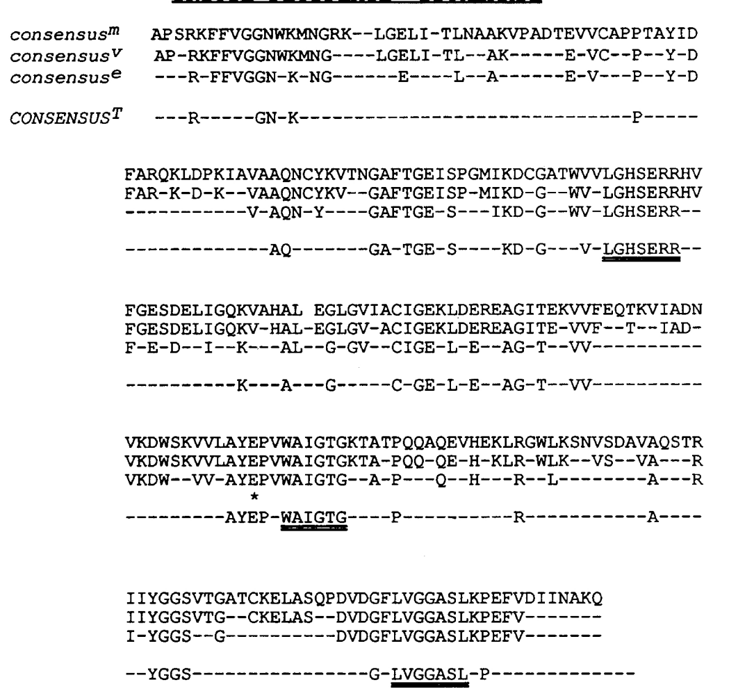
Figure 2: Patch identities are evident only in distantly related organisms. Sequences encoding triose-phosphate isomerase from different organisms were aligned. Consensus is the sequence shared by mammals (human and rabbit), consensus applies to the vertebrate enzymes (mammals, chicken and a fish, Latimeria), consensus summarizes the identical residues amongst all eukaryotes (consensus plus yeast) and consensus is the overall consensus for all species (including B. stearothermophilus).

homologous to the vertebrate enzymes, reduces the number of patches with five or more identical amino acids to 3. Thus, comparisons between amino acid sequences amongst proteins from the most divergent species, but with a common function are most likely to be helpful for the purposes described below.