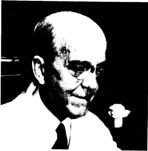
Oswald T. Avery