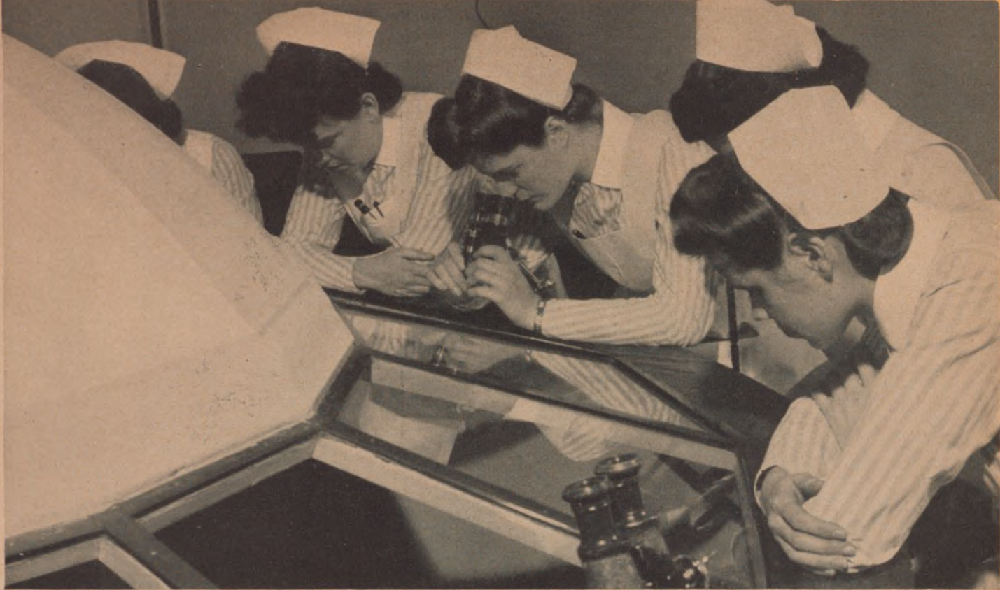
Student nurses in operating theater observing surgery.