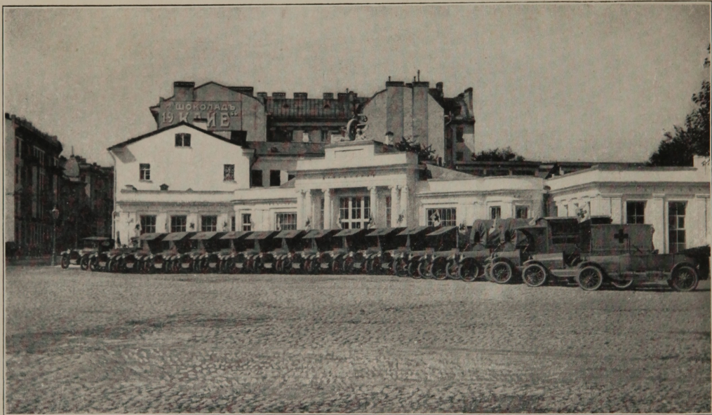
Inspection of Motor Cars of American Ambulance, Petrograd, Russia