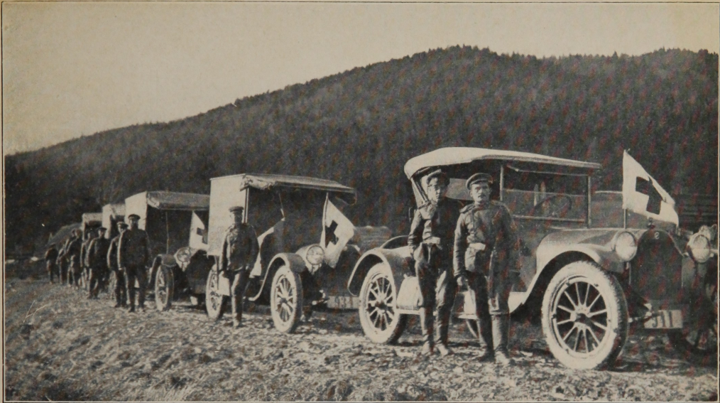
Cars of the American Ambulance at the Russian Front