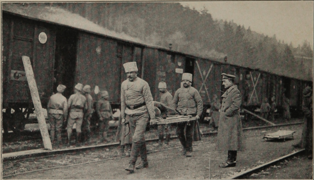
Loading Wounded Soldiers Into Freight Car Hospital Train from American Ambulance at the Russian Front