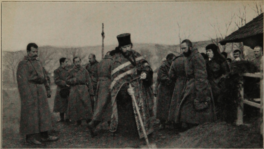
Russian Front in the Carpathians. Funeral of Young Officer Who Died from Lockjaw, Although Only Slightly Wounded. Sixty Cents Worth of Tetanus Antitoxin Would Have Saved His Life