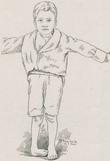
CASE VII.—Before Treatment.

October 1.—Inversion of foot corrected; has had redressment tri-weekly, thirteen sittings. (See photograph before and after treatment.)