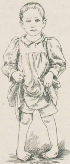
CASE VI.—Before Treatment

September 15. —Left corrected at eight sittings. (See photograph before and after treatment.)