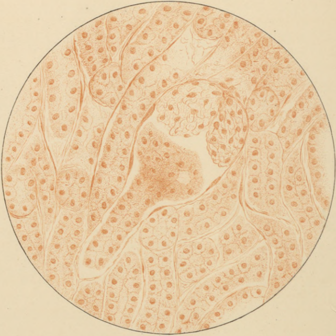
Cantharadin Nephritis. White Rat.