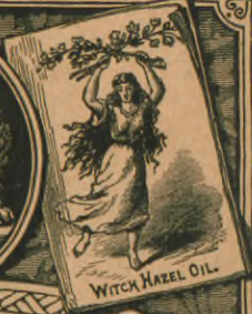
WITCH HAZEL OIL.