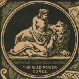
THE MILD POWER CURES.