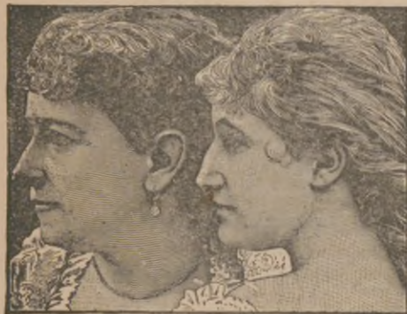
LIKE FATHER OR MOTHER?