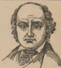
SIR JOHN FRANKLIN.