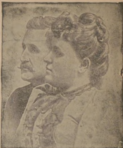
ARE THEY WELL MATED?