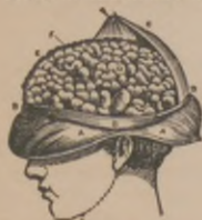
BRAIN IN THE SKULL.

back-head, of the Affections; the side-head, of the executive, propelling, constructive, and economical powers; the top-head, of the moral, spiritual, and religious Sentiments. And all these are subdivided, as seen in the pictorial head.