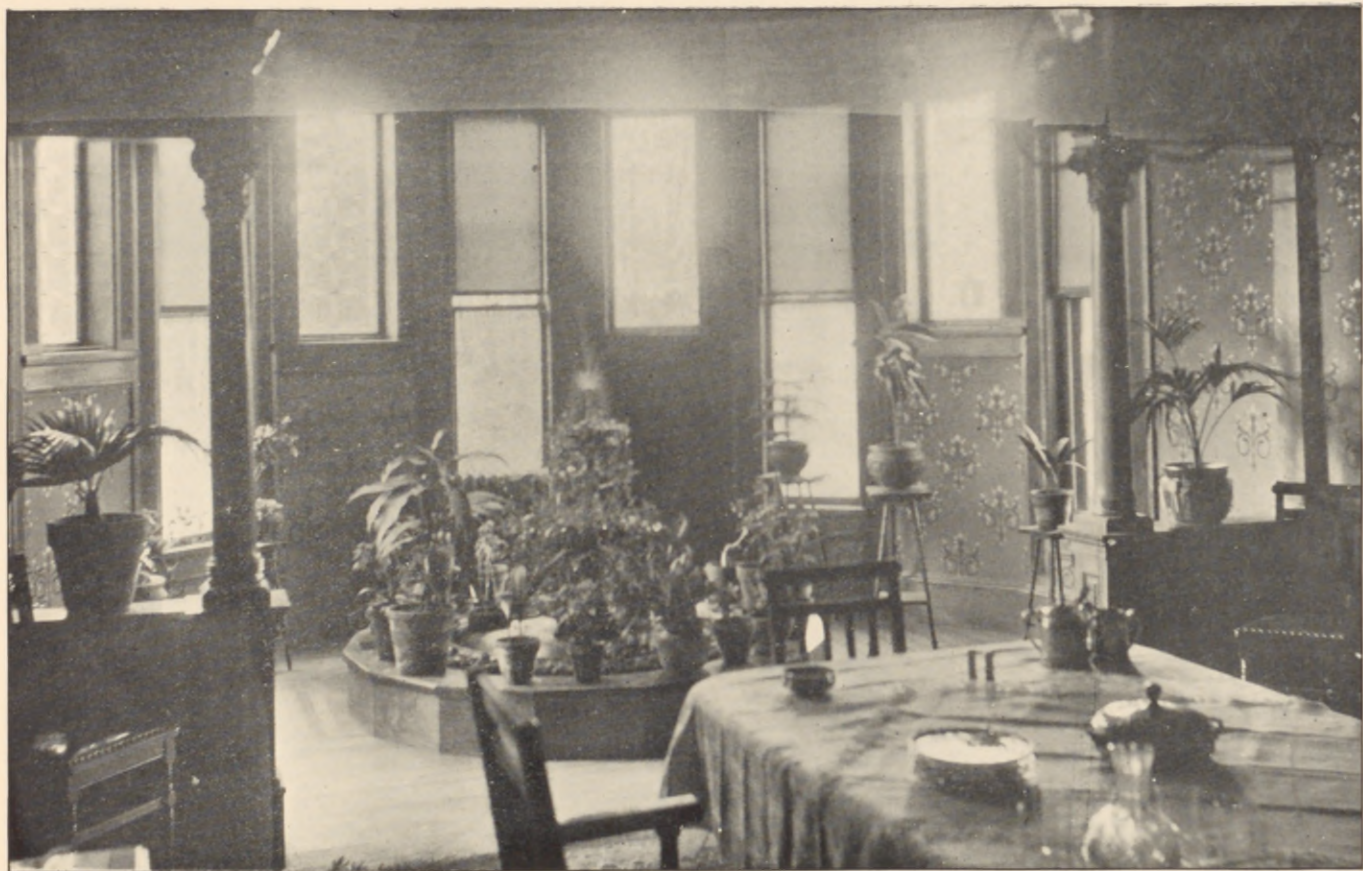
A CORNER IN THE DINING ROOM.