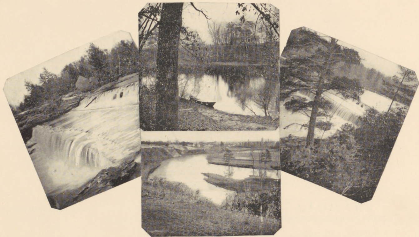
ON THE NASHUA RIVER.