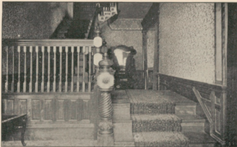
DETAIL OF HALLWAY.

Meals are served either in the pleasant dining room or in the rooms of those who may wish or require it.