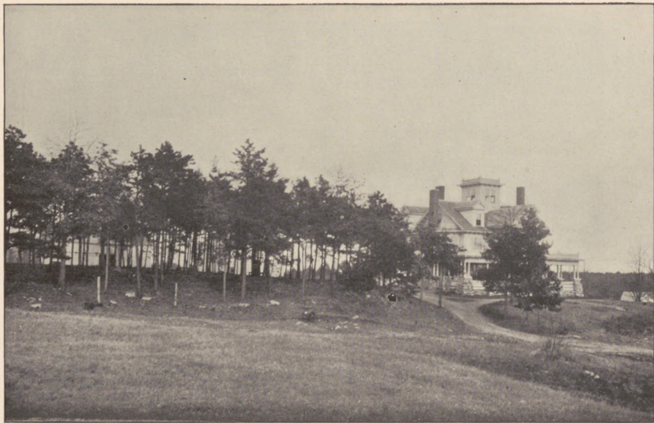
PINE AND OAK GROVES.