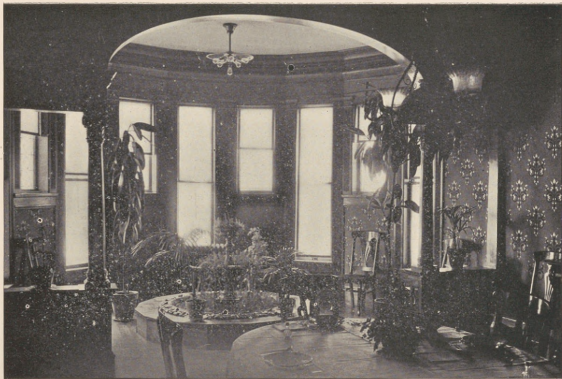
A CORNER IN THE DINING ROOM.