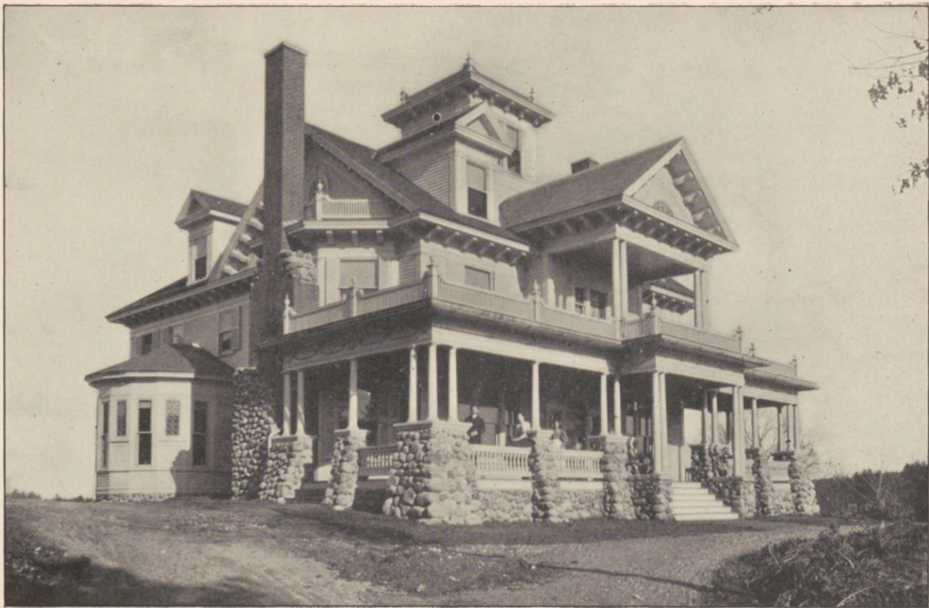
THE MAIN BUILDING.