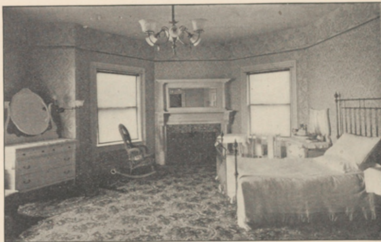
ONE OF THE SLEEPING ROOMS.

drugs will here find every possible means for the overcoming of the habit. Chronic medical cases whether of a nervous character or not will be received.