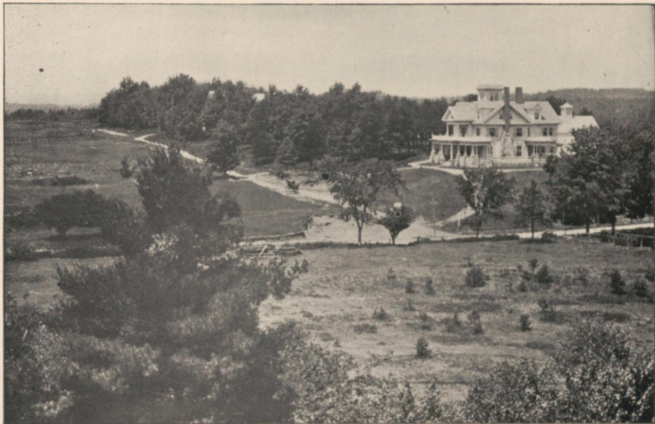
AMONG THE HILLS OF NEW HAMPSHIRE.