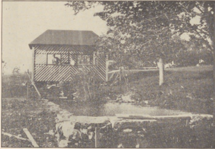
THE HIGHLAND SPRING.

Public Library, visit the theater, etc., in the town not far distant. Carriages make frequent trips to and from town, and are used for the pleasure driving of patients.