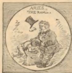
ARIES - THE RAM.