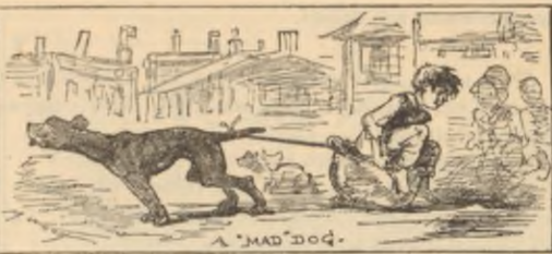
A "MAD" DOG.