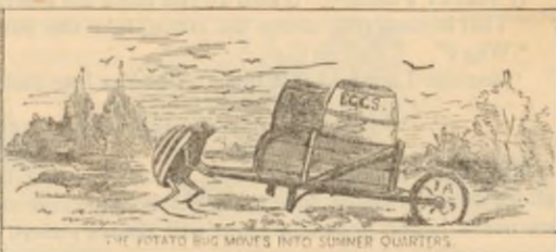
THE POTATO BUG MOVES INTO SUMMER QUARTERS.