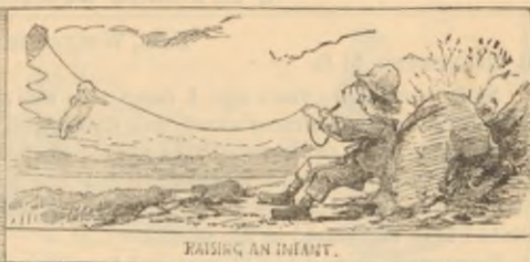
RAISING AN INFANT.