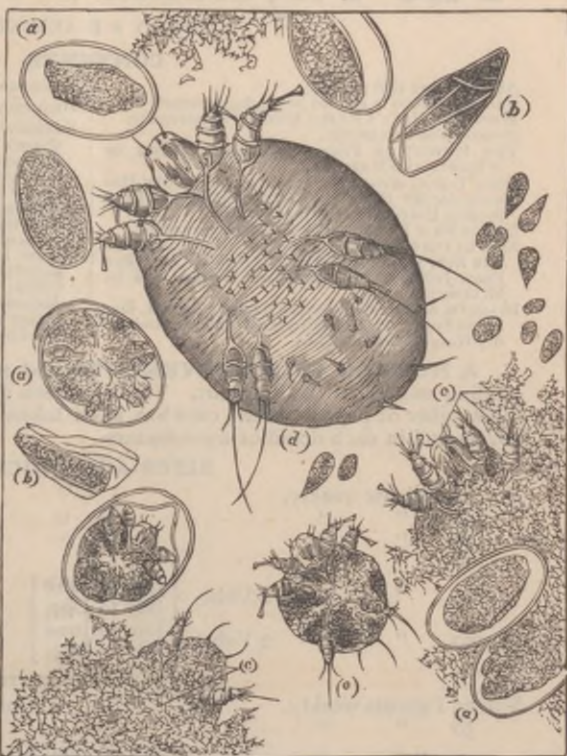
ILLUSTRATING THE EGG OF THE ACARUS, THE FEMALE, ETC.

* * * May be obtained of all booksellers, or will be sent, postage prepaid, to any address, on receipt of price. (Cloth, $4.50; Sheep, $5.50.)