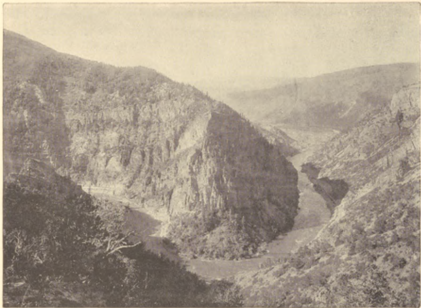
CANON OF THE GRAND RIVER, near Glenwood Springs.