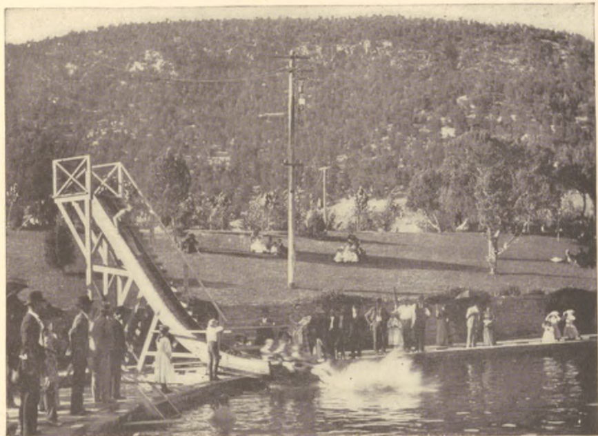
TOBOGGAN SLIDE FOR BATHERS.