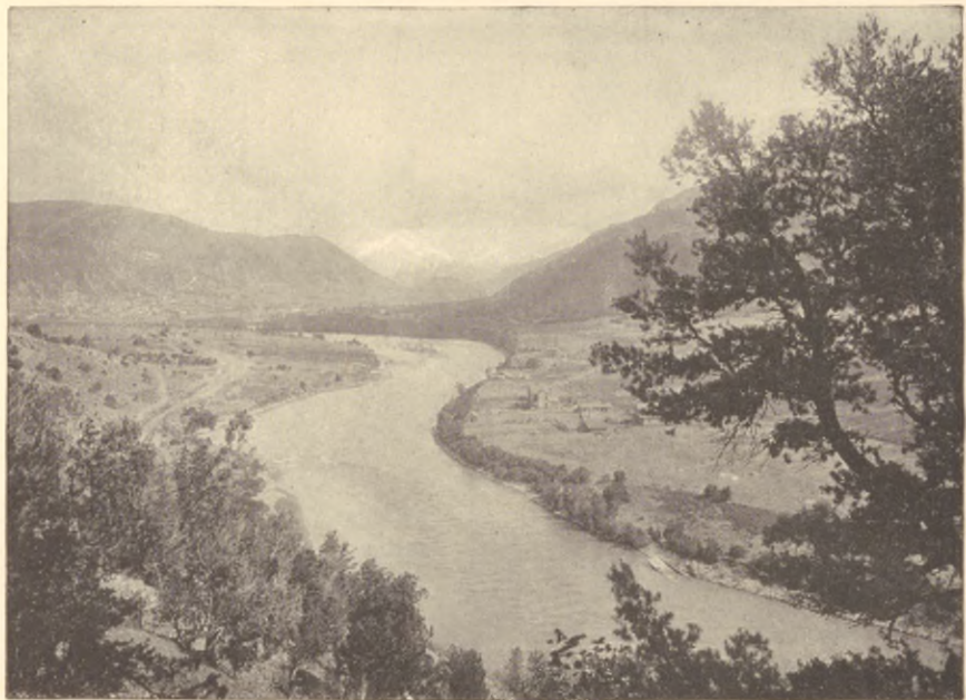
VALLEY OF THE GRAND RIVER—Mount Sopris in the Distance.