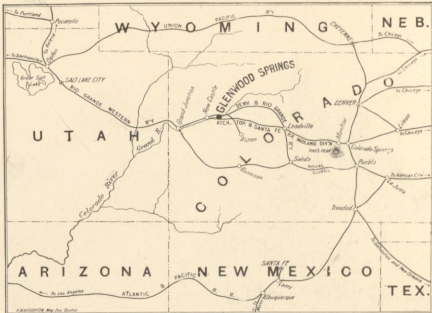
MAP SHOWING LOCATION OF GLENWOOD SPRINGS.