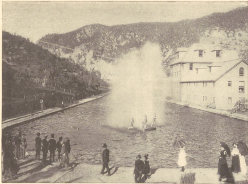
MAMMOTH SWIMMING POOL OF WARM SALT WATER.