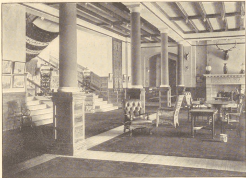
ROTUNDA OF THE COLORADO.