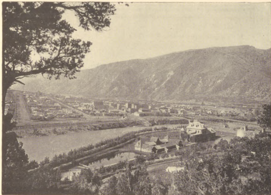
GLENWOOD SPRINGS, Showing Town, Springs, Bath-House, and Swimming Pool.