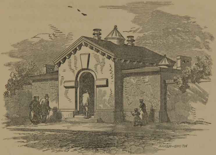
HOUSE OF RECEPTION, NORTH GROVE STREET.