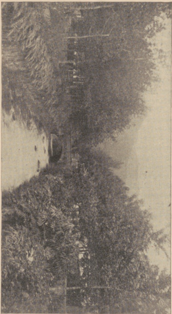
RIBEIRA QUENTE, VALLE DAS FURNAS.