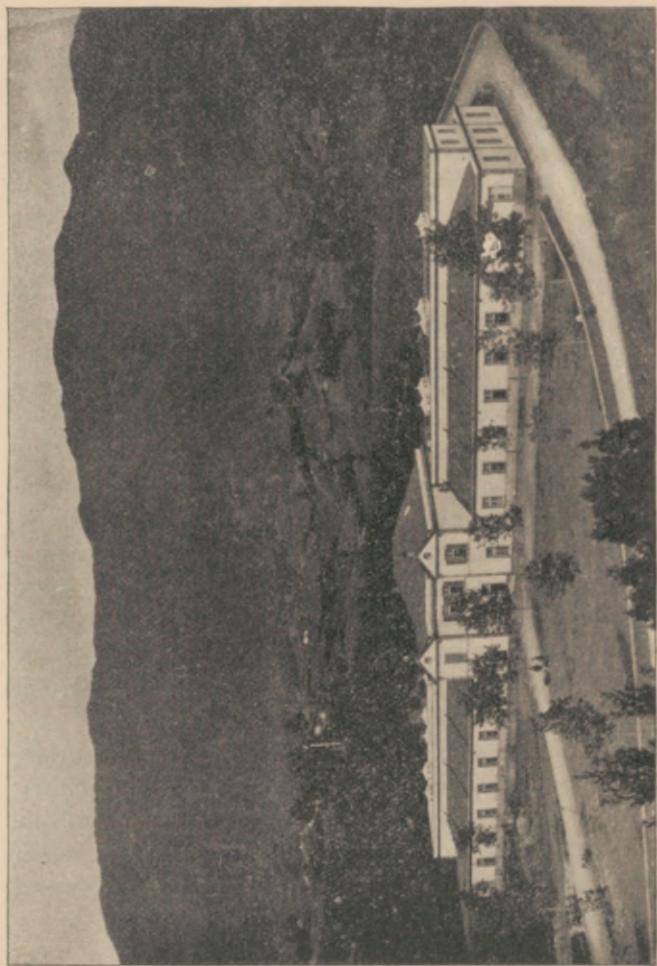
BATH HOUSE AT VALLE DAS FURNAS,