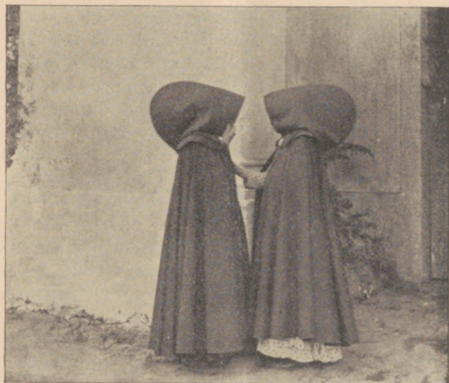
WOMEN IN "CAPOTES."