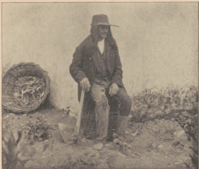
PEASANT IN "CARAPUÇA," WITH AZOREAN HOE.