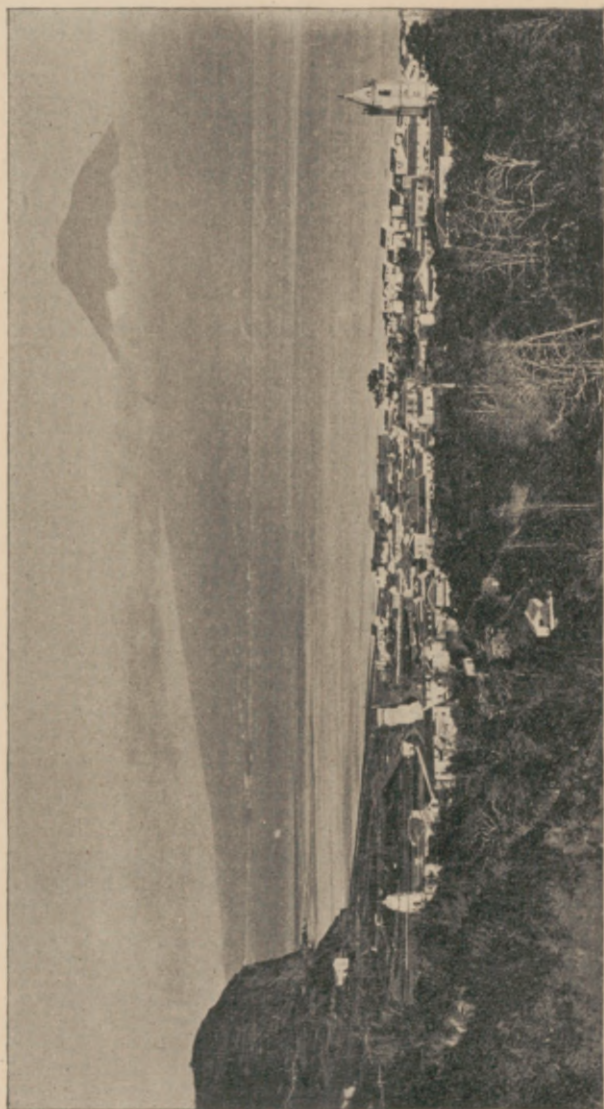
HORTA, CAPITAL OF FAYAL, WITH PICO ACROSS THE BAY.