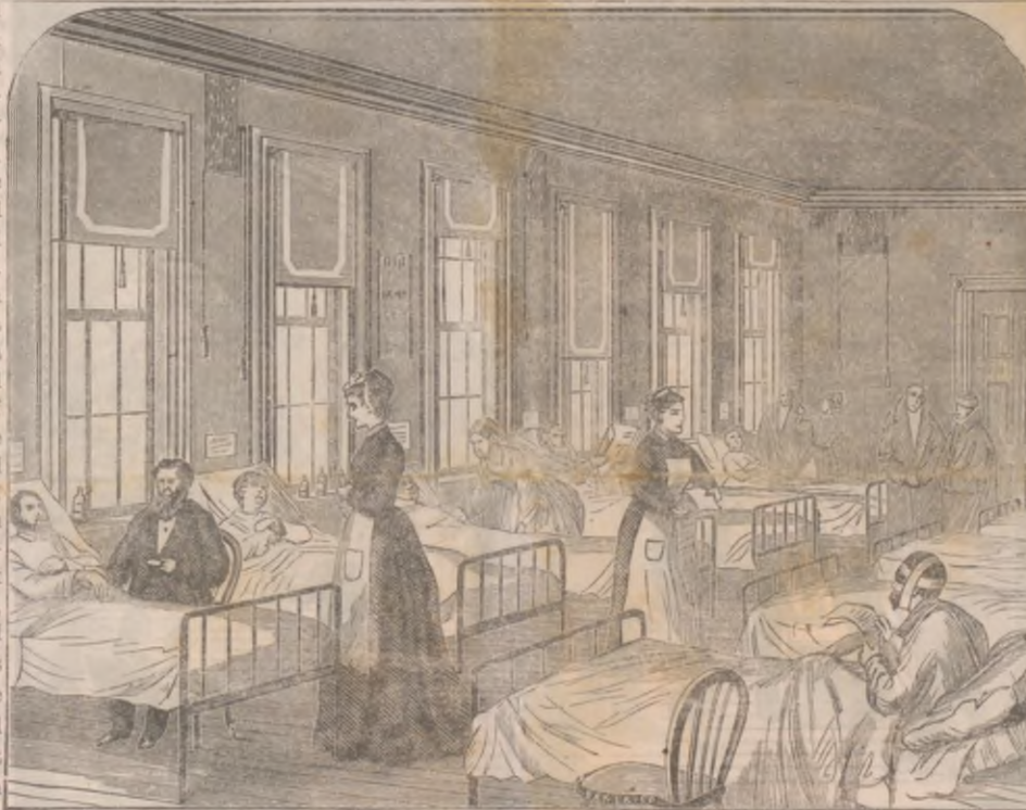
Represents the Leading Hospitals Using Dr. Richmond's Samaritan Nervine.

Numerous letters have been received from some of the most distinguished physicians in the country and from the Professors of several Medical Colleges, all recommending in the highest terms the value of our medicine, and its superiority over all other preparations.