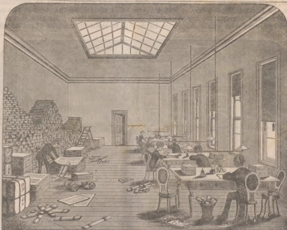
Mail and Editorial Department.

Answer—Do you see, if you find his card in your county paper, or if he has a sign over his office door, if so, what is it there for? Is it not to direct the attention of the public to him and his business? If so, that is advertising, and you should tell him to take down his sign, or brand him as a humbug. He advertises in his county paper and we advertise in a paper of our own; therefore, he is an honest man, and we are humbugs. Is that logic? No sir! We are in the same boat.