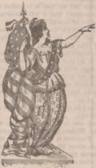
Faith and Good Works.

In view of these facts, and knowing that we have cured thousands of the worst cases of Epilepsy and have never failed to effect a perfect cure when we have had a reasonable chance. We hereby offer in good faith, $500.00 reward for a case of Epilepsy that we cannot cure. We claim that we can cure any and every case of Epilepsy, if our directions are faithfully followed. Why, then, trifle with this disease? Reader, why put off the sure means of cure we offer? Do you not know that procrastination is the thief of time? Do you not know that insanity and idiocy are among its frequent results, and that thereby thousands of graves are filled? Is it not a duty that you owe to others as well as yourself to get rid of this terrible disease? Do not think that the disease will in time wear out. On the contrary, it will, unless cured, wear you out. Do not think that you cannot be cured. The world moves, and medical science is progressive. Many forms of disease which would once have been entirely incurable with the means then known, are in the light of more recent discoveries in medicine, very easily cured.