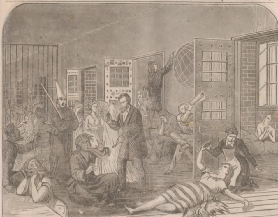
Represents the Leading Lunatic Asylums Using Dr. Richmond's Nerve.

cerebro-spinal disease, or to sudden and violent fits of passion. Indeed it may be said that the offspring of those who have thus labored under nervous affections receive that peculiar organization from their progenitors that predispose them to Epilepsy. Masturbation is a most prolific source of this disease. Hundreds have already confessed to us, both male and female, that they had been taught to masturbate, and continued the practice for several years, and realizing the sinfulness of the habit, discontinued it, and were afterwards tormented with sexual desires and experienced the venereal orgasm almost nightly during sleep. There are cases recorded where servant women who had charge of little girls, deliberately taught them the habit of self-abuse, in order that they might exhaust themselves and go to sleep quietly. Such little girls have become idiotic. There have been cases under our observation in which persons had experienced the first paroxysm during the first act of sexual congress after marriage; subsequently a paroxysm occurred at each marital connection, but after a time paroxysms took place without this exciting cause, and they would become confirmed epileptics. The disease may arise from numerous causes, as gastro-intestinal derangement, acid stomach, worms, improper food, painful dentition, blows, wounds, external violence to the head or spinal column, uterine irritation, calculi or stone in bladder, violent mental emotions, as anger, fear, terror, dis-