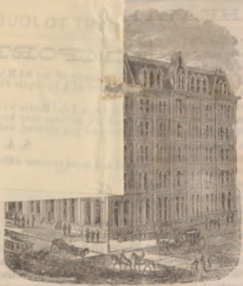
LONDON BRANCH, London, England.

This is the first and largest Institution of its kind in America.