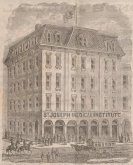
ST. JOSEPH MEDICAL INSTITUTE.