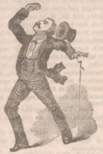
Epileptic Fits Permanently Cured.

Thousands of our best Physicians send their Patients here for treatment.