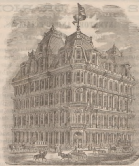
PARIS BRANCH, Paris, France.