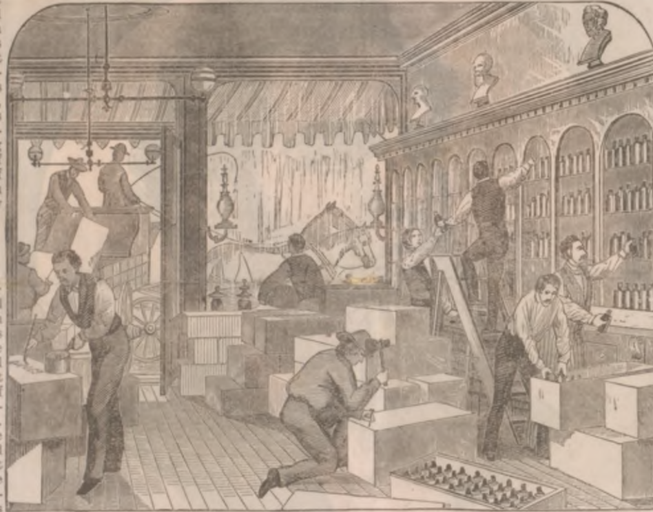
Represents the Ware, Stock and Shipping Department.