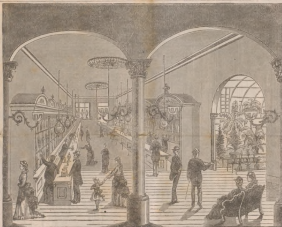
Chemical and Drug Department.

With this medicine we cure every case of Epileptic Fits, Spasms, Convulsions, St. Vitus Dance, and all Diseases of the Nervous System; such as Nervous Prostration, General Debility, Neuralgia, Hysterics, Paralysis, Vertigo, Trembling of the Hands or Limbs, Apoplexy, Weak Back, Bilious Headache, Swimming of the Head, Catalepsy, Congestive Headache, Nervous Headache, Infantile Paralysis, Inflammation of the Brain, Stiffness of the Muscles, Shaking Palsy, Urethra, Vaginal Neuralgia, Inflammation of the Bladder and Prostrate Gland, Enlargement of the Prostrate Gland, Irritability of the Bladder, Urethra or Prostrate Gland, Female Decline and Painful Menstruation, and during