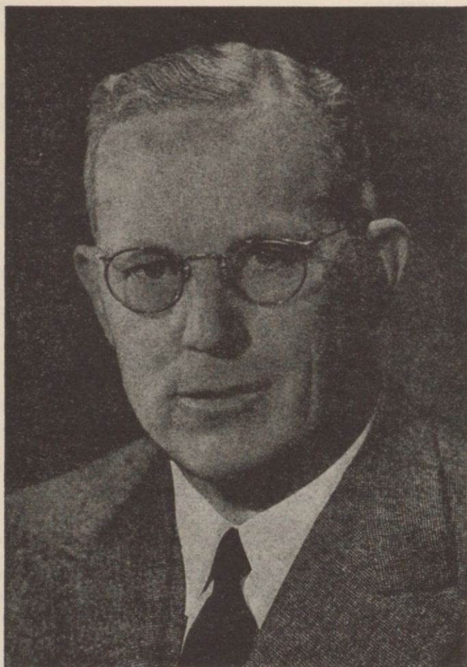
GOVERNOR EARL WARREN