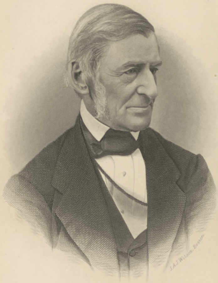
R. Waldo Emerson