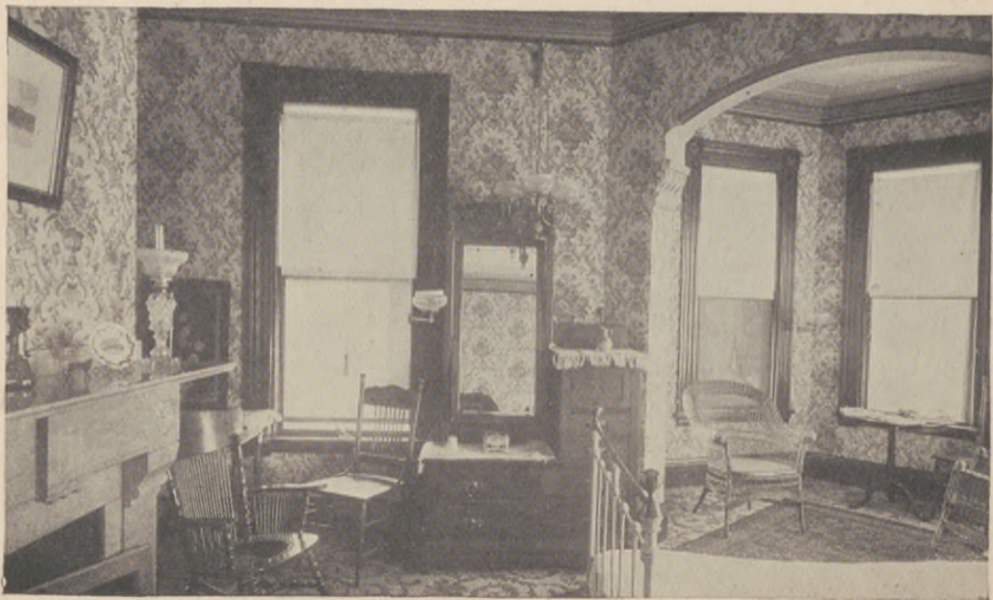
A SLEEPING ROOM.