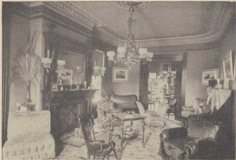
DRAWING ROOM, WITH A GLIMPSE OF THE LIBRARY.