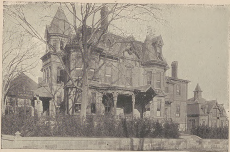
WALTER BAKER SANITARIUM.