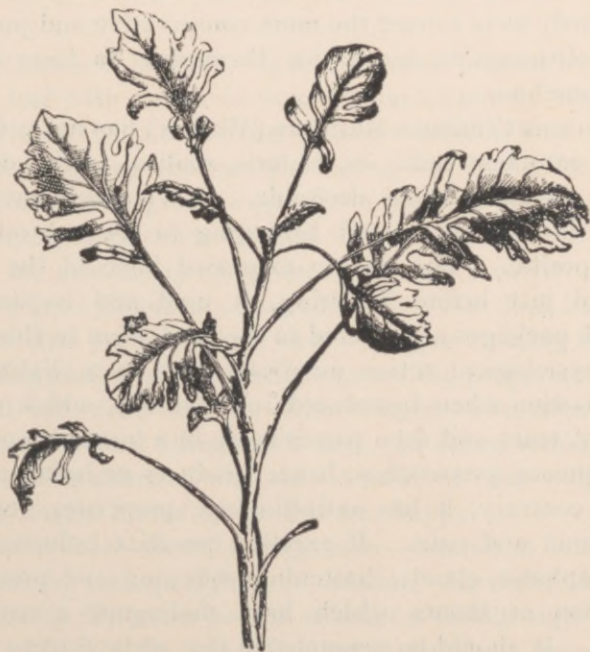
SUCCUS CINERARIA MARITIMA.

ingly valuable instruments of precision, as well as by a number of remedies of great value. Among these Succus Cineraria Maritima (Walker) ranks among the first. Its special sphere of usefulness is found in the treatment of cataract. It is hardly necessary to dwell on the etiology of this well-known pathological condition here. Broadly considered,