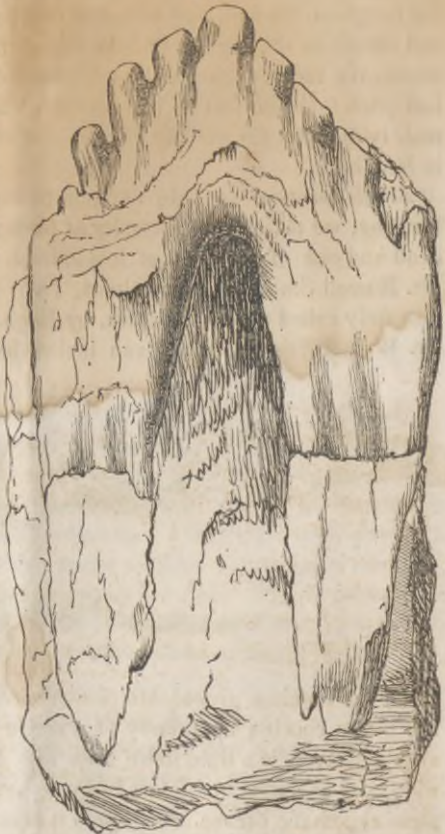
Two-thirds natural size, lineally.