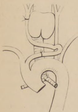
Diagram illustrating a cirroid aneurism of right common carotid, and points of ligation.

OBSERVATION 2.— Arterial varix (cirroid aneurism) of the right common carotid extending from origin to a point one inch from bifurcation. Double ligature of the common carotid; one below bifurcation of the carotid and one over the dilated trunk itself. Recovery with aseptic healing of wound and apparent improvement in aneurismal condition.