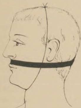
Obs. 5.—Diagram illustrating application of elastic compression of upper lip for arrest of hæmorrhage in hæmophilic subject. (Dr. Matas' Collection.)

In August, 1894, I was called to attend a little Italian baby, aged 9 months, nursing at the breast. It accidentally fell on its face and contused the upper lip and lacerated the mucous membrane at the gingivo-labial commissure, corresponding to the bridle of the upper lip. Little importance had been attached to the accident at the time, but the continuous bleeding which took place from the laceration in the lip decided the parents to call the family physician, who upon examination regarded the injury as trivial in view of the small extent of the laceration, which did not exceed one-quarter of an inch and was very superficial. Washes with