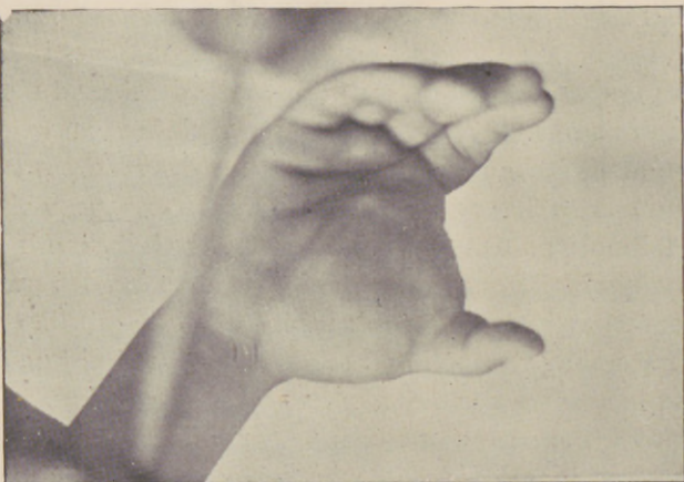
FIG. 2. Palmar Aspect

OBSERVATION 8.—Cavernous Angioma of the Hand. (Dr. Matas' collection.)