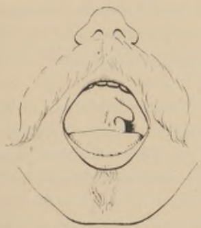
Supposed Aneurism of the internal carotid bulging into fauces. Showing displacement of palate and encroachment of tumor into pharyngeal isthmus.

OBSERVATION 3. —Suspected aneurism of the right internal carotid, possibly of traumatic origin, projecting into the fauces and threatening life by suffocation, etc. Ligature of common carotid at point of election. Recovery.