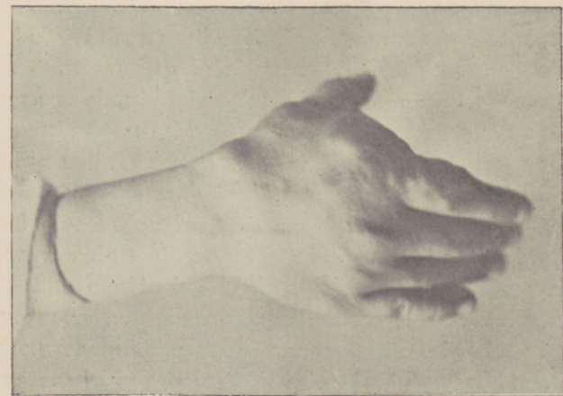
FIG 1. Dorsal Aspect.